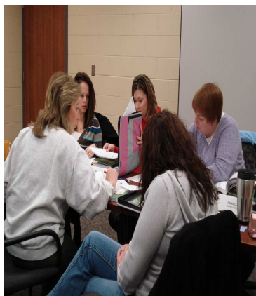
Primary teachers collaborate during IMPACT (Improving Mathematical Practices and Classroom Teaching) training.